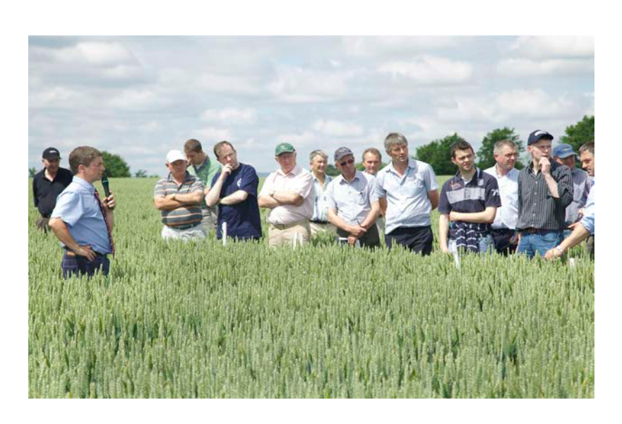
Bring research to the field Improve the interaction