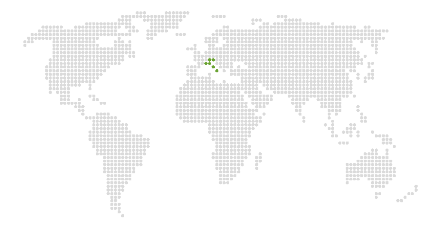
Italy Cluster Chimica Verde