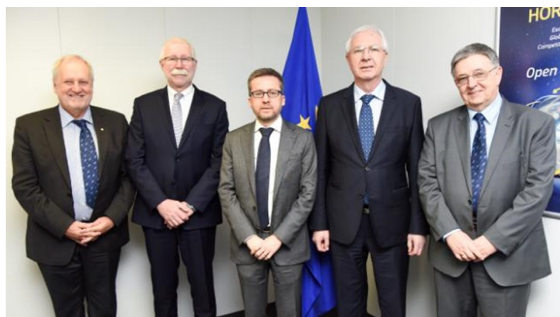
Presidents of V4 Academies of Sciences with Commissioner Carlos Moedas.