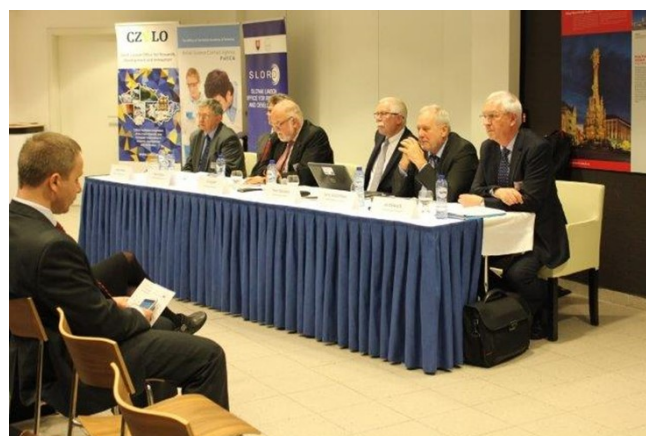
Discussion panel during the presentation of V4 Academies of Sciences.