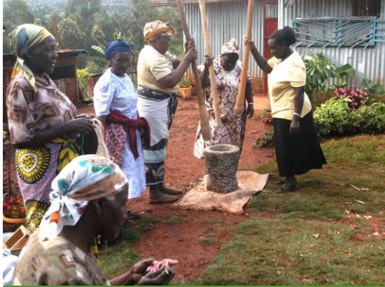
Village woman. Location: Kenya