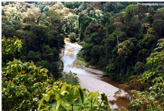
Rainforest on the Island of Borneo

Forest soils release carbon when fertilizers are applied, now a global phenomenon. Nitrogen pollution from burning fossil fuels and from agricultural fertilizer use is transported around the globe and deposited by huge transcontinental dust clouds. When deposited in tropical forest soils, they result in a dramatic rise (about 20% annually), in soil carbon emissions by increasing microbe metabolism 13