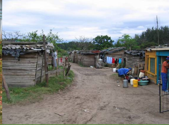
Plantation workers. Location: South Africa

Nigeria is one of the world's leading oil producing nations, with oil accounting for 95% of government revenues. Yet the oil industry is in the hands of multinational oil companies and most oil is exported: Nigeria actually imports 70% of the oil used domestically. Under the absurd guise of improving energy security, Nigeria is now moving to develop agrofuel production, using cassava, palm oil and sugar cane, which will most probably increase food insecurity.