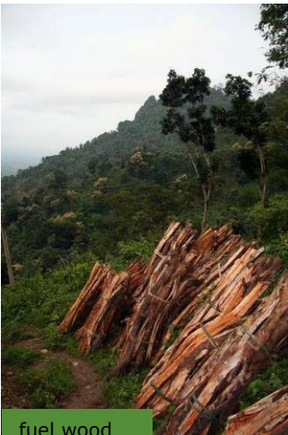
fuel wood cut from the rainforest of Java