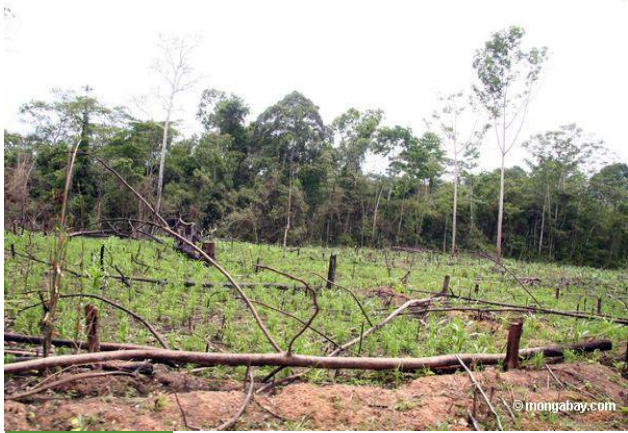
Rainforest cleared for maize. Location: Puerto Maldonado, Mongabay