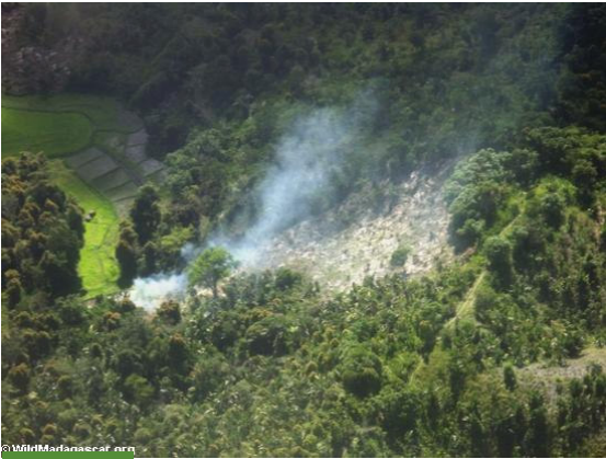
Agricultural fires set in humid forests of Madagascar.

The Inter-American Development Bank's Blueprint for Green Energy in the Americas 46 , outlines a 'vision' in which a huge investment in capacity expansion (more infrastructure, developing markets and the promotion of technological innovations) will enable countries in the south -