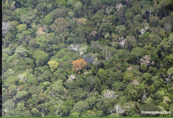
Flowering trees in the rainforest canopy Southeastern Peru

Even so, this very conservative figure amounts to a loss of close to 8 million hectares per year, or 22,000 hectares/day. If plantations are excluded from the calculations this figure could rise as high as 32,300 hectares permanently lost every day while an equivalent area is also degraded. 32 Tropical deforestation rates increased by at least 8.5% between 2000 and 2005, with over 10 million hectares of tropical forest lost each year since the 1990's. Furthermore, during the same time period, there was a 25% increase in the loss of primary forest compared to the previous 5 year period. 33 These losses are not evenly distributed across the globe. Deforestation has been much higher in tropical forests of Latin America, the Caribbean, Africa and Southeast Asia, where 80% of the world's remaining primary forest stands. According to FAO, these losses of primary old growth tropical forest are "countered" by gains in forested land in some temperate areas. But these are in fact tree plantations, largely in China, EU and North America. In other words, on a global scale old growth forests, the most biodiverse ecosystems on earth and critical to climate stabilisation are being replaced by barren industrial monoculture tree plantations, sometimes of introduced exotic species, in countries like China, the EU and North America.