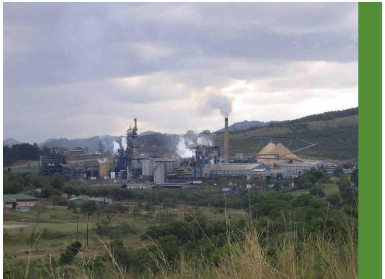
Pulp mill pollute and poison the environment, by Wally Menne, Timberwatch Coalition

The pulp and paper industry is also the fifth largest industrial consumer of energy. The revenues of large multinational corporations like International Paper rank higher than national GDP in at least 75 countries, and they thus yield tremendous power and influence.