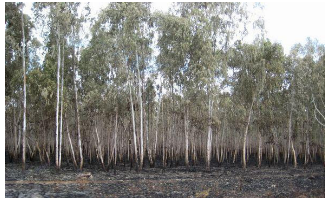
Burned Eucalyptus plantation. Kenya

Unfortunately, the FSC has undermined its own intent by granting certification to large scale industrial monoculture tree plantations which bear very little resemblance to forests and are in fact a cause of both deforestation and the displacement of indigenous people. Certified as 'ecologically and socially sustainable forests', these plantations are often areas in excess of 100,000 hectares, all a single species, and often exotic introduced species. They are grown on lands that were formerly occupied by indigenous people who relied on healthy, diverse forests for food, materials, medicines, and clean water.