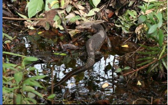
Swamp forest, Borneo.

"Without major changes in water management, how are we going to feed a growing population, satisfy increasing demand for meat, and, on top of that, use crops as a major source of fuel?" (David Molden, International Water Management Institute.) 1