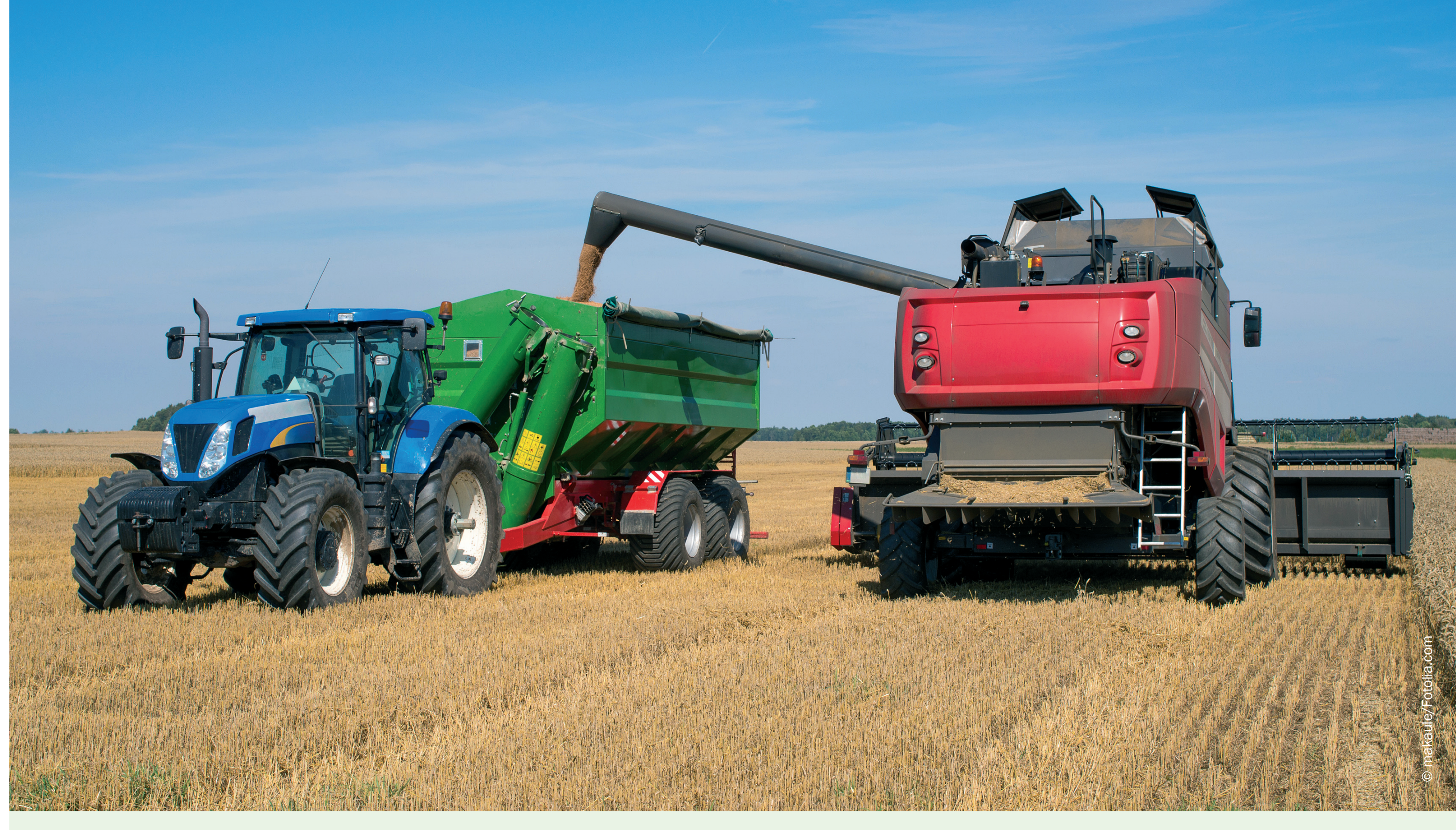
As a producer of renewable raw materials, the agricultural sector is of strategic importance to the bioeconomy.

1) Concepts for enhancing the competitiveness of the German agricultural sector should be designed in such a way as to minimize any negative impact upon socially valuable protected resources (land, biodiversity etc.).